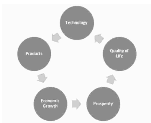
Figure- 2. Technology and National Economy

Technology has always played a major role in creating the wealth of nations and influencing standard of living and quality of life. Economists have debated the value of